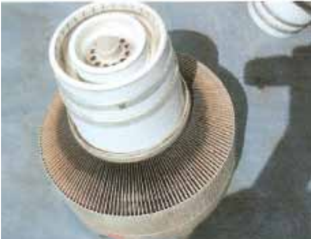
Figure 5. This tube shows evidence of being well mounted in a socket for at least a year (note the marks on the contact ring from the finger stock). However, there is no discoloration of the stem and the anode fins have very little discoloration. This tube will last for a good period of time because it is being run under favorable conditions.