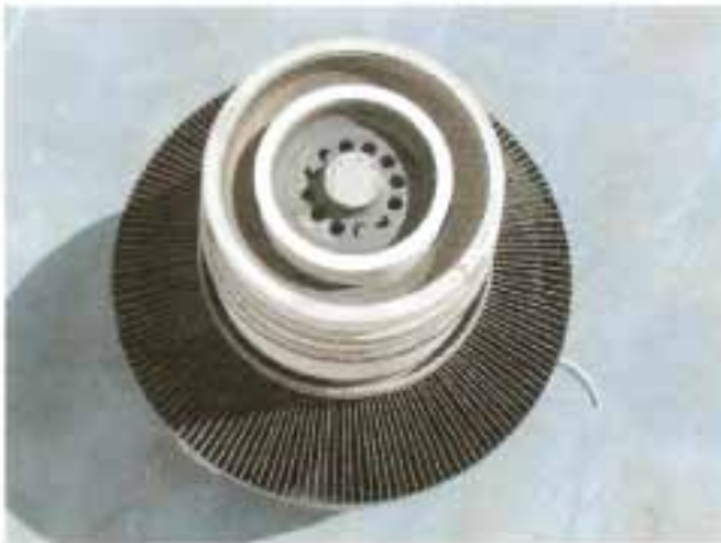
Figure 6. This tube appears to have been in a socket for only a short time, but already has evidence of overheating. Note the discolored stem and anode fins. This tube will have a short lifetime.