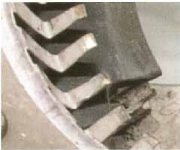
Figure 7. Bent and broken finger stock. Finger stock may become damaged due to effects of overheating or mishandling. Any broken finger stock must be repaired or replaced immediately to ensure long tube life.

The key to extending the life of a thoriated tungsten filament emitter is to control operating temperature. Emitter temperature is a function of the total RMS power applied to the filament. Thus, filament voltage control is temperature control, because temperature varies directly with voltage. Figure 8 shows that useful tube life can vary significantly with only a 5% change in filament voltage.